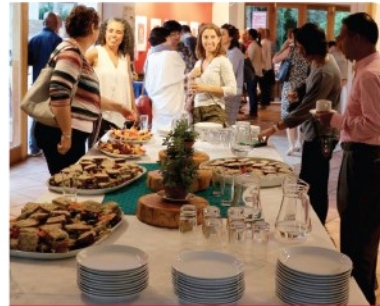
Meeting and greeting at the New Parents' Evening

A roundup of news in this week's newsletter includes a report on the New Parents' Evening, reminders about forthcoming workshops, a book sale on 7 and 8 February and feedback on recent sporting activities. Our pack of 10 cards, beautifully illustrated by Michael Mount children, is on sale at the coffee shop. Scroll down for a report on the winning artists who were awarded a book voucher in assembly.